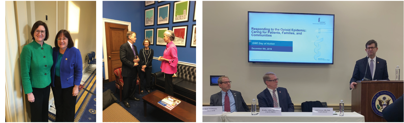
In 2019, ASAM leaders met with Members of Congress and participated in the Graduate Medical Education Advocacy Coalition's Day of Action in December 2019.