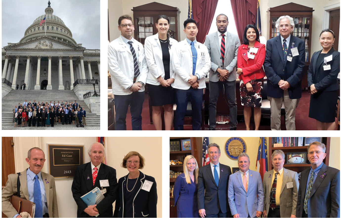
ASAM organized a "Hill Day" for ASAM members to meet with Members of Congress in September 2019.